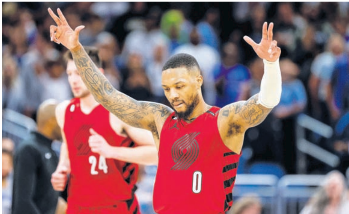
Portland Trail Blazers guard Damian Lillard (0) celebrates after a shot against the Orlando Magic during the second half of an NBA basketball game, Sunday, March 5, 2023, in Orlando, Fla.

As with all trades, it cannot be finalized until NBA attorneys review the terms and approve the deal.